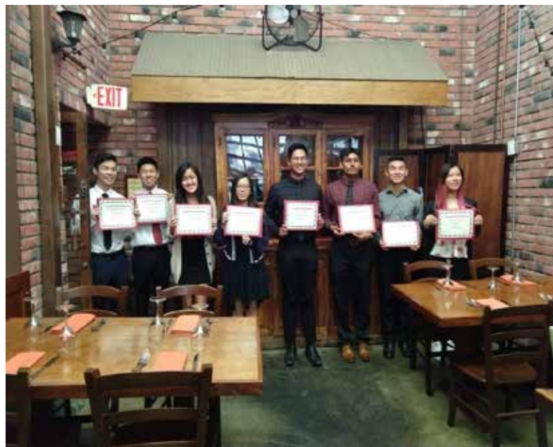
Scholarship winners from 2019 shown. 圖片為2019年獎學金獲獎者

For more info, please contact AAEDE Scholarship Coordinator via: www.aaede.info • aaedeinfo@gmail.com • (626) 572-7021