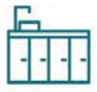
COUNTERTOPS & TABLETOPS