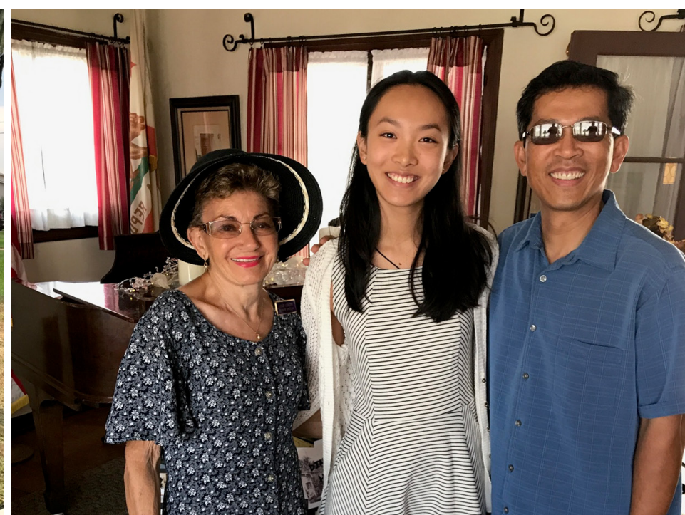
Rosemead High School Basketball Team Volunteering at Dinsmoor Heritage House Annual Luncheon